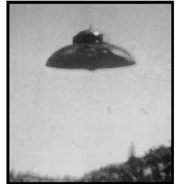
June 16, 1963 near Albuquerque, New Mexico

Will the Chariots deliver everyone that believe in their existence? NO! Only the elect of the Israelites! Read: II Kings 2:11-12, Rev. 11:3-6 (Isa. 49:6 & Luke 2:32 = The Prophets of Israel) & Rev. 11:7-12, (Isa. 60:8-10 & Acts 1:9-11 - Clouds = Chariots of Israel), II Thess. 1:6,10.