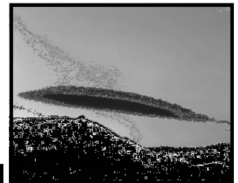
"...who make the clouds his chariots: who walketh upon the wings of the wind..."